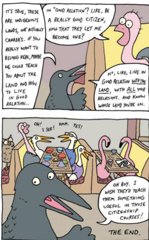
figure 3. Illustration on page 58, Doug Savage, “Migratory Birds.”

of the video game makes this comic one of the most effective in communicating its message without feeling rushed or abrupt, as some of the others do. The final four comics in the collection offer commentary on various aspects of belonging: the comic “In Search of Bruce Lee” offers a positive wordless visual narrative about how connections made through pop-culture can transcend national boundaries; a message that broadly connects with the message of the final comic. “The Waiting Room” and “Butterfly,” placed between these two positive narratives, offer commentary on the isolation, health problems, and loss of social status that can occur for immigrants, particularly people of color.